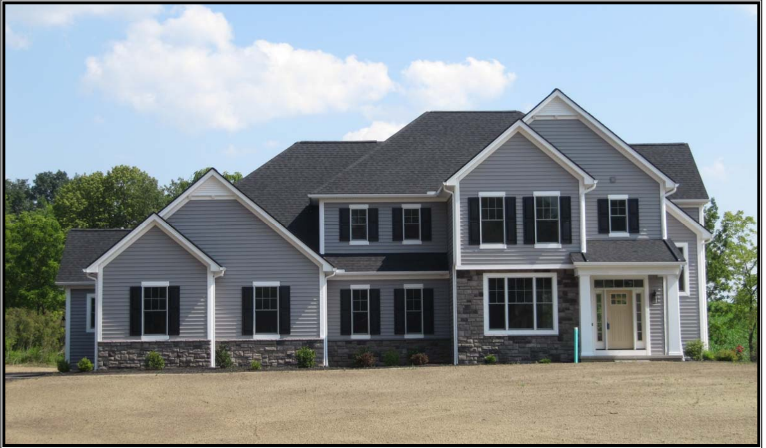
Lot 6 Arbor Glen - Victor, NY