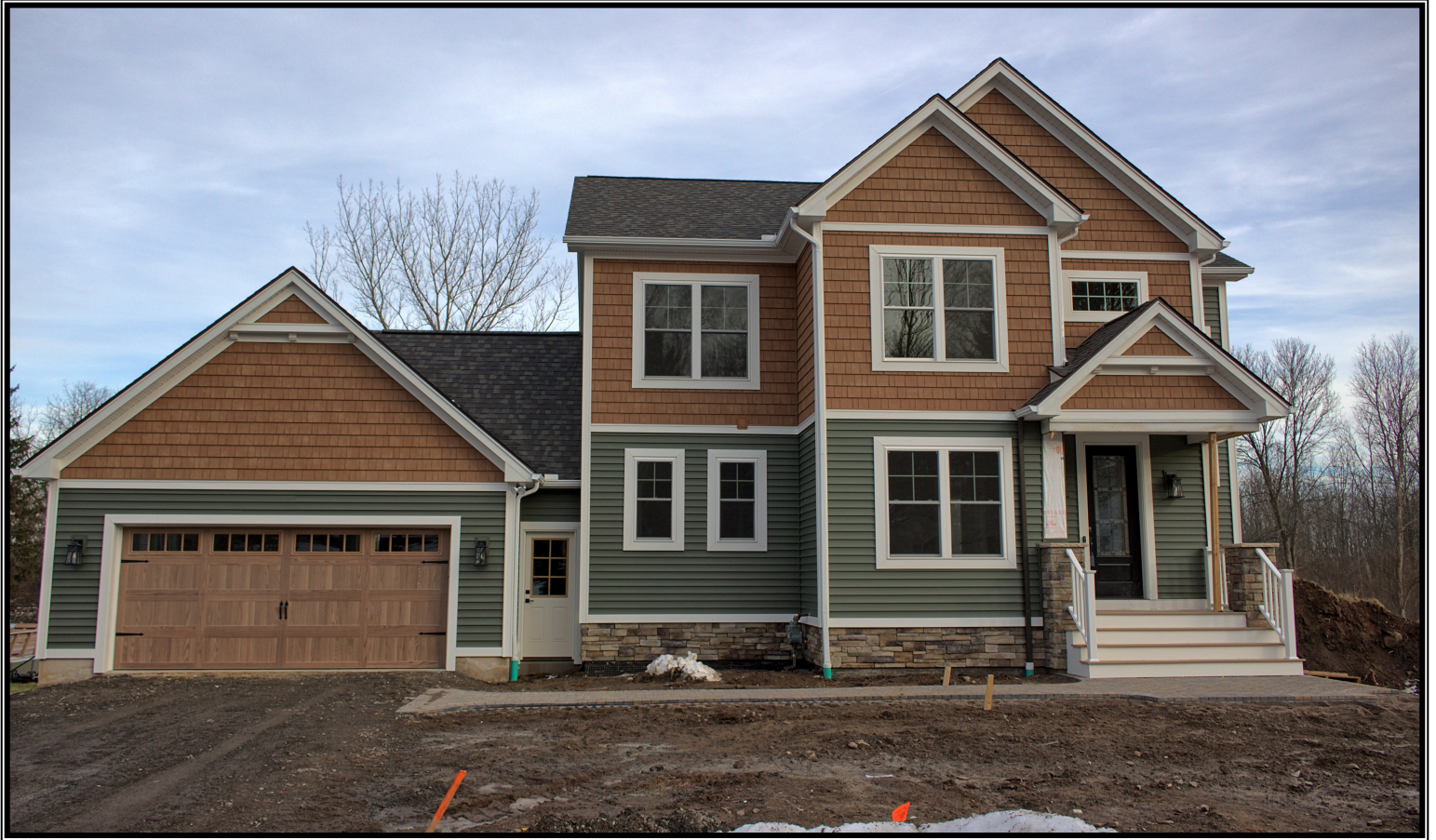
Lot 7 Pinnacle Hills - Brighton NY