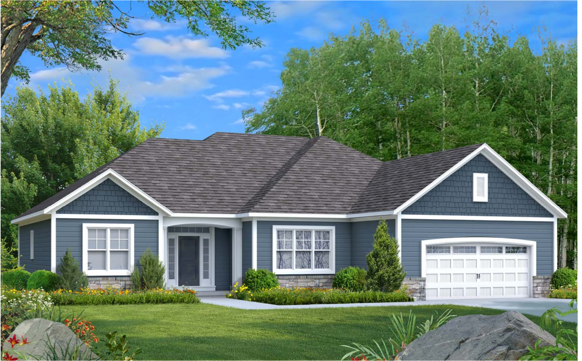
Ranch Portfolio Plan — 2,166