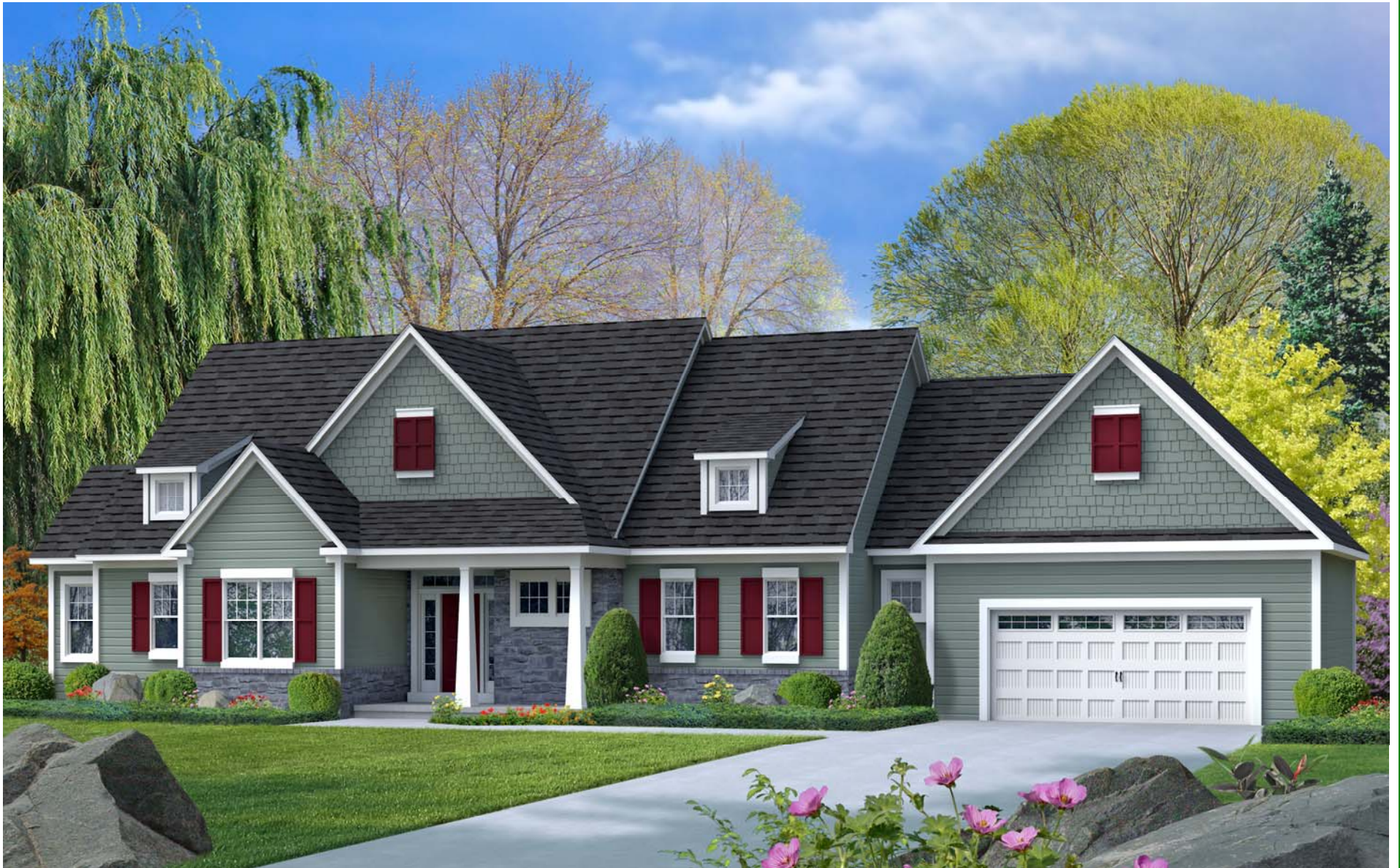
Ranch Portfolio Plan — 2,126