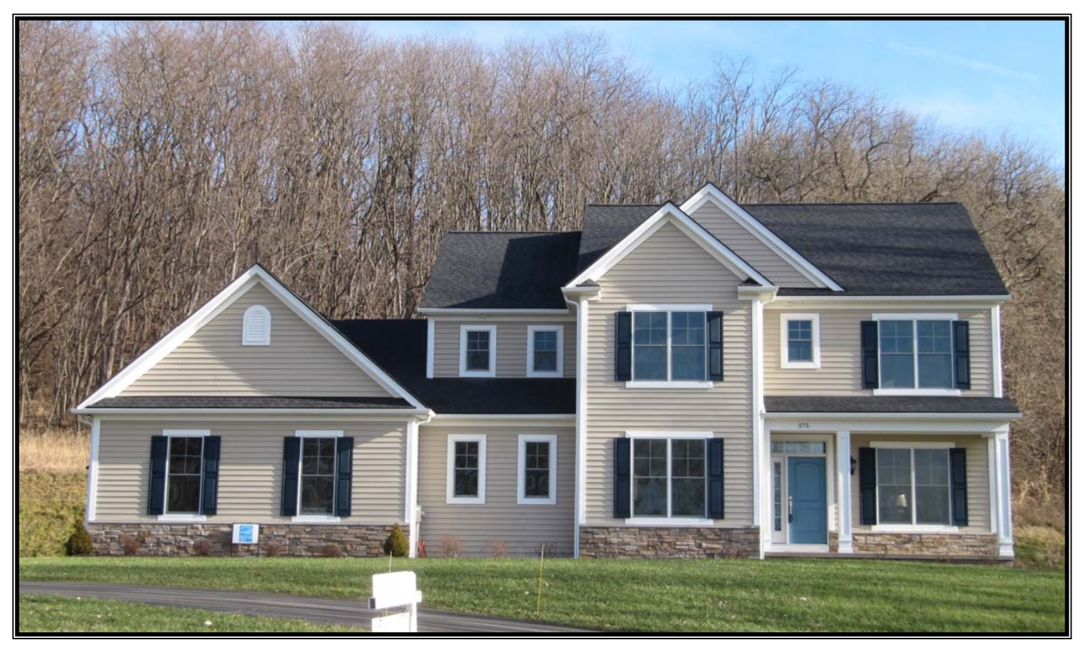
Lot 8 Arbor Glen - Victor, NY