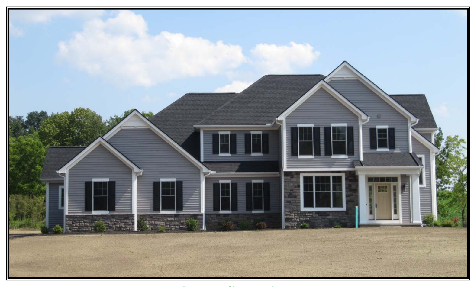
Lot 6 Arbor Glen - Victor, NY