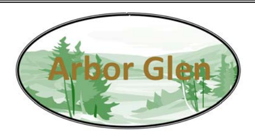
379 Bridlewood Lane (Lot 6) Home Specifications