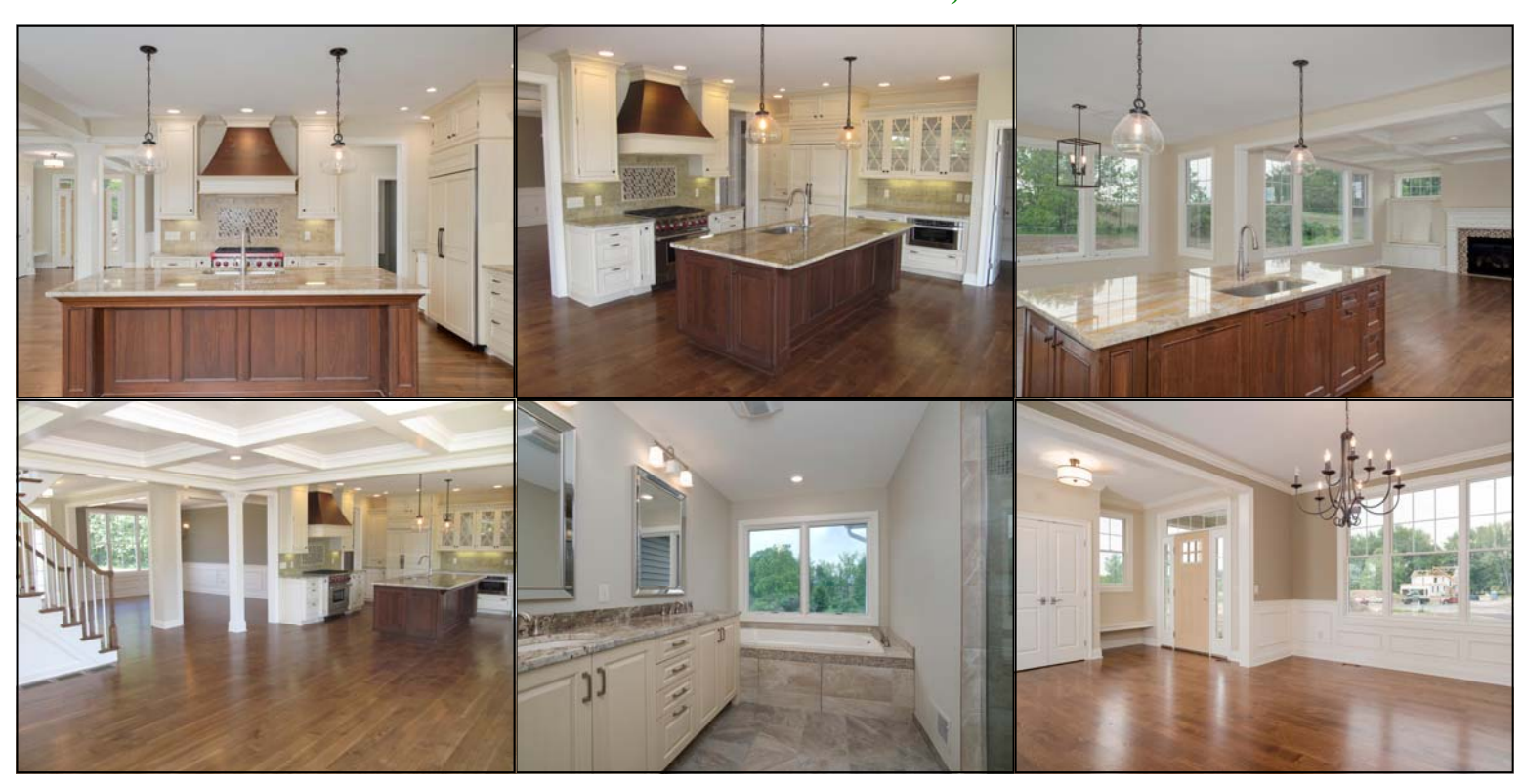
Woodstone Custom Homes, Inc. • 15 Fishers Road, Suite 114 • Pittsford, New York 14534 • www.woodstonenet.com