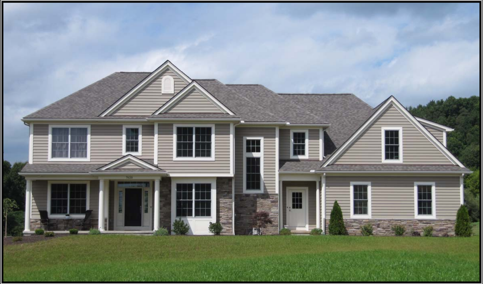
Lot 20 Arbor Glen - Victor, NY