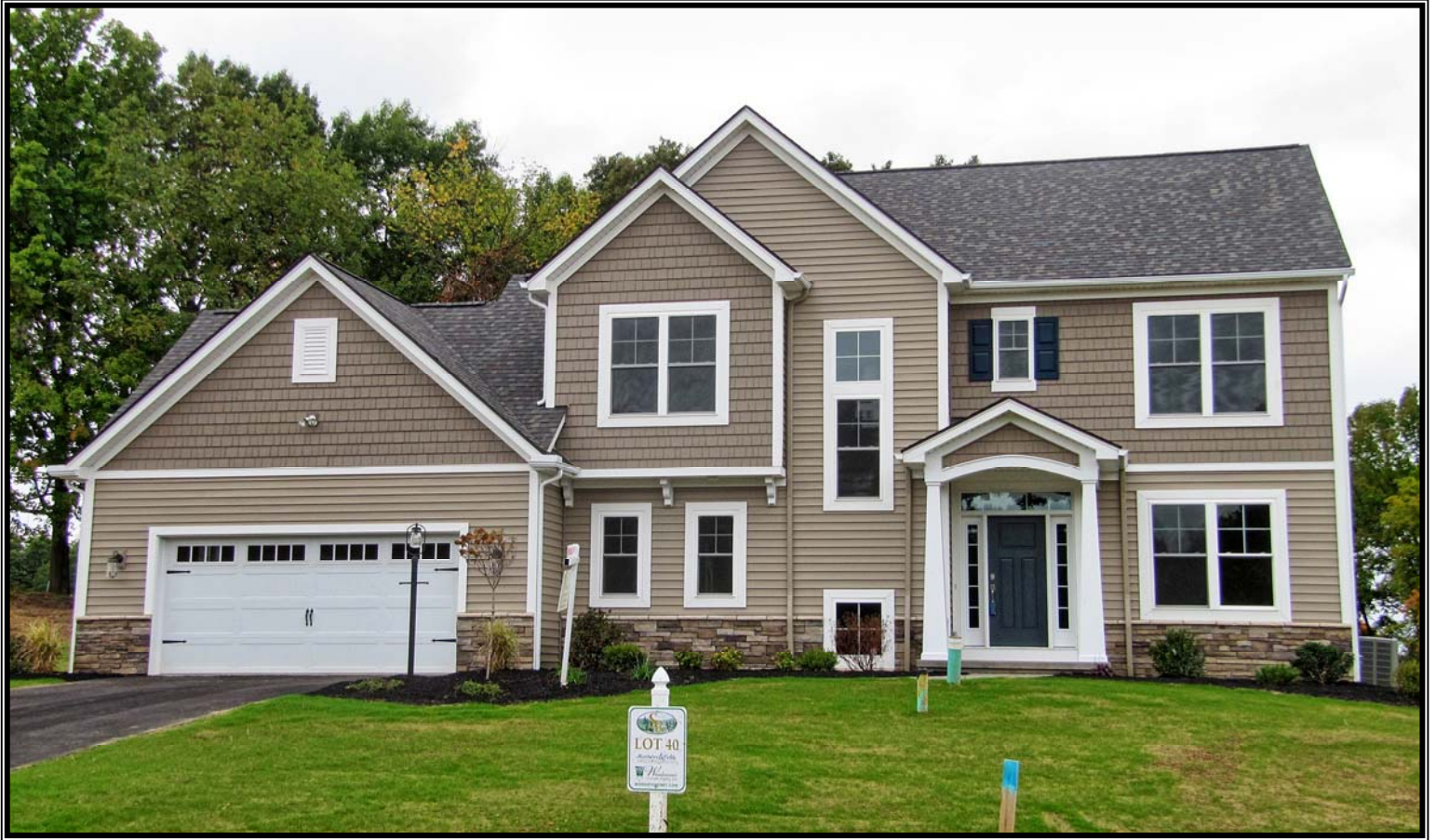
Lot 40 Stonington Ridge - Victor, NY